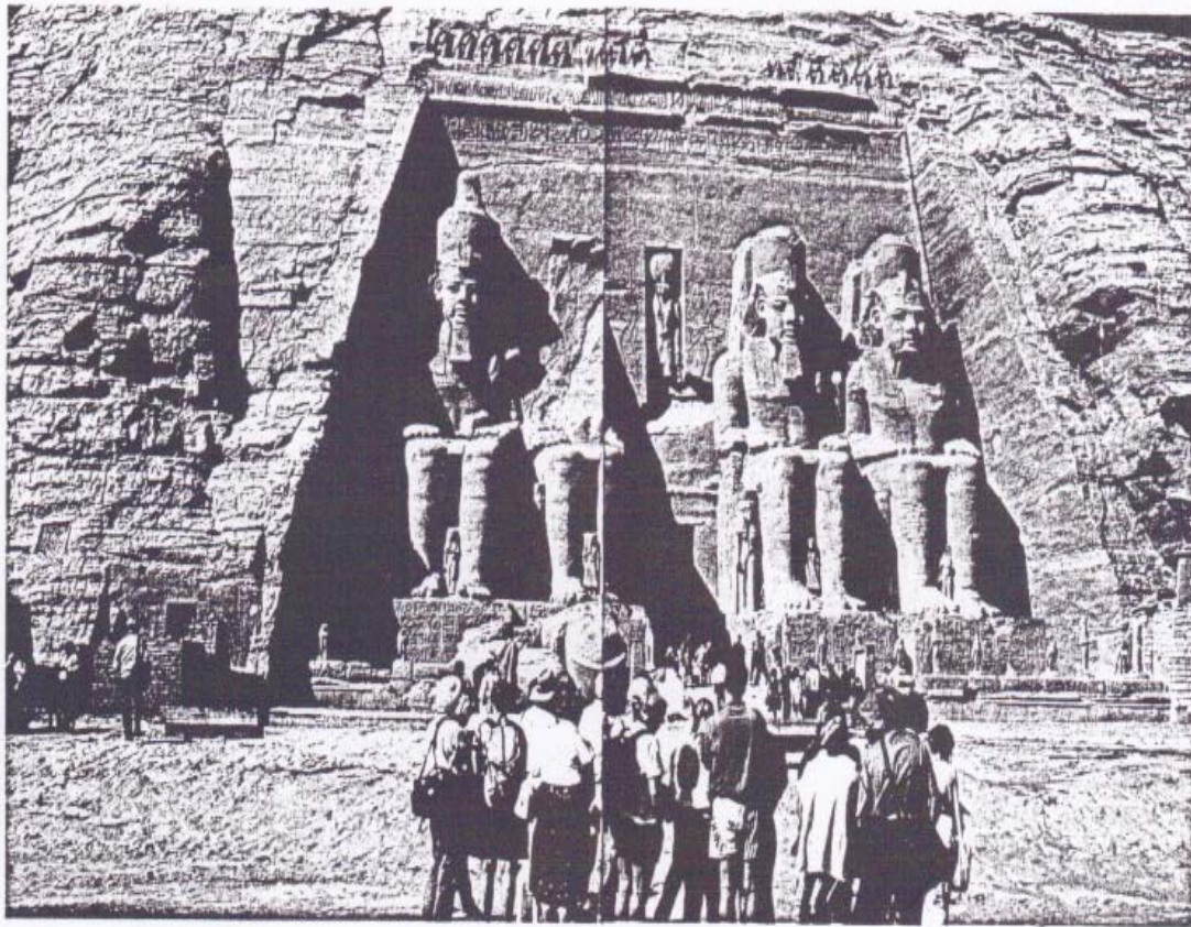
The Great Temple of Ramses II

"... a witness turned to stone as evidence to posterity of the power of the divine Pharaoh".